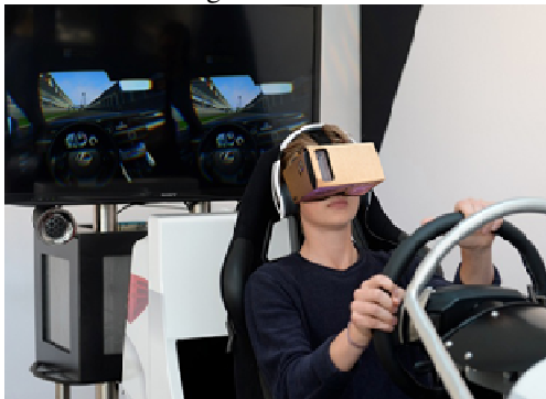
Fig 4. Driving Simulator using Google Cardboard (VR)

In due time to apply for R.T.O learning licence we had to give an online examination. We plan to replace the online test with a virtual driving test. in which the test cases will be similar to the question and will be more of life. For an example if the speed limit given 30 km/hr and the driver breaks the speed he fails at that point. Our application will be a summation of such test cases which will automatically generate result if learning licence.