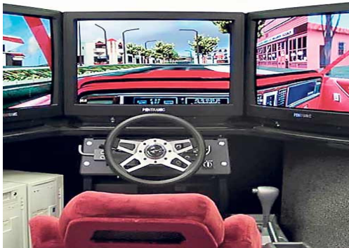
Fig 3. 2D Driving Simulator

driving while video playing in T.V and according to driver moves like right turn or left turn using steering wheel or apply the brakes to stop so that the car in the video also response accordingly.