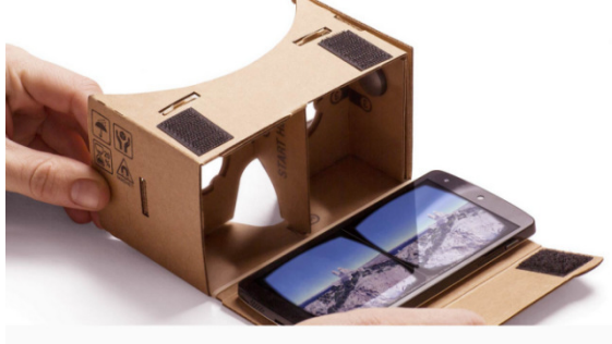
Fig 6. Google Cardboard

Google recommended Biconvex lenses because they prevent distortion around the edges.