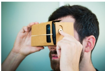
Fig 7. Magnet in Google Cardboard

Google Cardboard include magnet, NFC tag. Once you have the Android App installed on your NFC-enabled mobile device, touch the front or back of your device to the sticker then it should launch the android app so that you don't have to launch it manually! All that's left before experiencing VR is to insert your mobile device into your Cardboard VR headset and a rubber band and held against the face, affords a virtual reality experience. A Smartphone with android app fits into Google Cardboard and the lenses allow a person to receive left and right images as a single three-dimensional image. Essentially, the assembly works by presenting two slightly different images, one to each eye. This is achieved by the application on your smart phone the screen in two and a strategically placed piece of card inside the viewer dissects the two images. Because each of your eyes is looking at a slightly dissimilar image, with the rest of your view blocked out so it creates an immersive 3D environment. The Google Cardboard project aims at developing inexpensive virtual reality (VR) tool to allow everyone to enjoy VR in a simple natural way. The Cardboard SDK for android helps to developers familiar to OpenGL so that they quickly start creating VR applications.