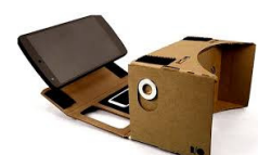
Fig 2. Google Cardboard