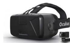
Fig 1. Oculus Rift

Now a day's many brands of video glasses can now be connected to video and DSLR cameras, making them applicable as a new age monitor. As a result of glasses ability to block out available light so that filmmakers and photographers are able to see clearer presentation of their live images. The Oculus Rift and Google cardboard is an upcoming virtual reality (VR) head mounted display as both comparison Google cardboard is cheaper than the Oculus Rift HMD.