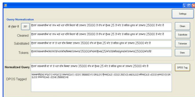
© 2018, IJCSE All Rights Reserved

Erroneous outputs were due to incorrect tagging to words that were not identified by the system due to their absence in the database tables.