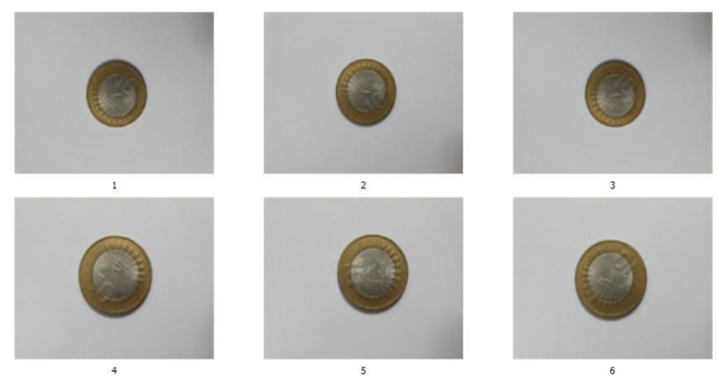
Figure 2. Real coin image samples from the dataset

The first stage of the dissimilarity measure is to extract the coin images from the image background. Normally the coins are in circular shape, except some ancient coins, which are not considered here. When the image is not captured well, it may appear as an ellipse. So, we apply Hough transform for ellipse detection. Afterwards the captured elliptical coin image is normalized to a circle. The local detectors and descriptors analyze the key points of the coin images. The DOG detector first detects the key points using the SIFT descriptor. The combination of DOG detector and SIFT descriptor performs well in many applications. For the two coin images their dissimilarity can be obtained from the number of matched key points. Lesser the number of matched key points, more dissimilar the images will be. Since there are many key points in a coin image, searching the closest neighbour is computationally expensive. In order to alleviate this problem we exploit the polar coordinates over Cartesian coordinates since coins are in the circular shape. Thus we represent the key point on an image by (r, \theta) in polar coordinates, where r represents its normalized radius, obtained by dividing its distance from the centroid of the coin by the coin radius. \theta represents its polar angle.