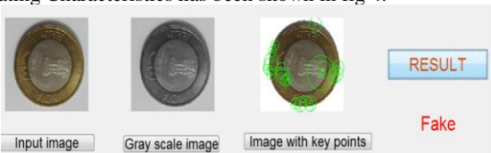
Figure 3. Graphical User Interface for Coin Authentication

For the fake Indian coin detection work, the data set has been created using the Indian 10 rupee coins. The sample images from the data set have been shown in figure 2. The coin images are captured and converted into the grey scale format. The experiments are done using Indian coins. From the extracted coin images from the background, the training has been done using the real coin images. The dissimilarity space value shows the dissimilarity between the coin images. From the dissimilarity values prototype has been selected for minimum dissimilar values. Testing has been done using the fake coins; SVM classifier gives an indication about the authentication of the coin, whether the coin is real or fake. The whole work has been interfaced through GUI as shown in figure 3. This work shows an accuracy of 82%, and the Receiver Operating Characteristics has been shown in fig 4.